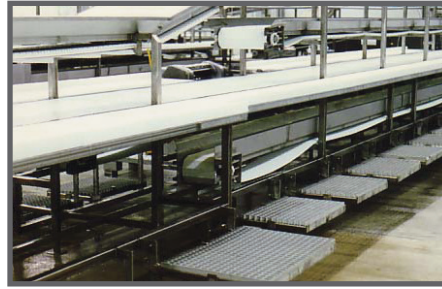
FGI-AM® Resin with Antimicrobial Properties