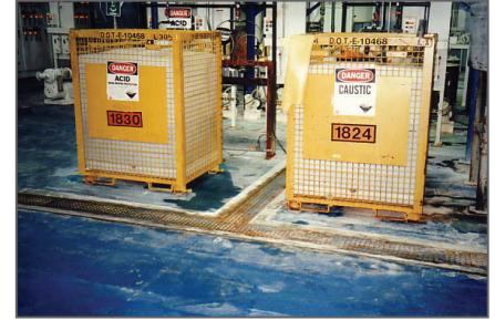
Super Vi-Corr® Resin for Highly Corrosive Environments