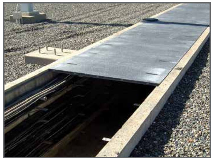
Solid FRP Trench Covers