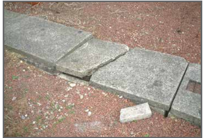
Traditional Concrete Trench Covers

Why not provide an aesthetically pleasing Fibergrate FRP cover that will continue to provide durability and safety for years to come?