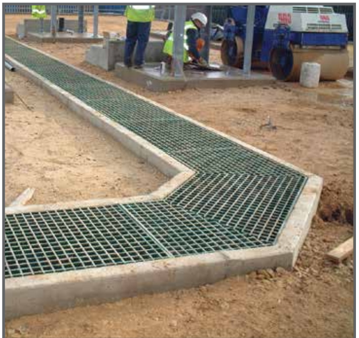
After Installation of FRP Trench Covers