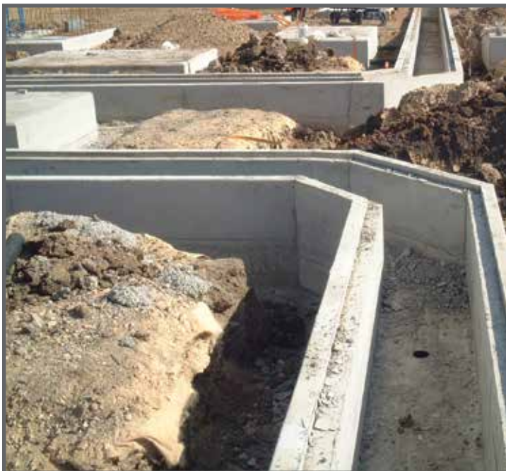
During Construction of Utility Trench