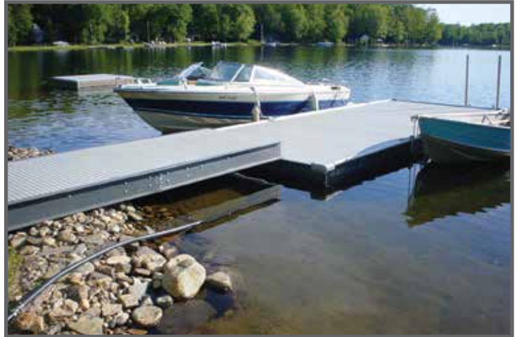
Boat dock on Horseshoe Lake in Haliburton, Ontario.

Aqua Grate T1210 and T1215 pultruded pedestrian grating is specifically engineered to withstand the corrosive conditions associated with recreational and general marine applications and to meet ADA guidelines. With its nominal 1/4" space between the 1-1/2" wide bearing bars, Aqua Grate offers optimum comfort and safety for bathers walking with bare feet — a must in high traffic, public recreational areas. Aqua Grate grating has a unique combination of corrosion resistance and light weight which provides easy, inexpensive installations in such facilities as swimming pools, water parks, marinas and piers.