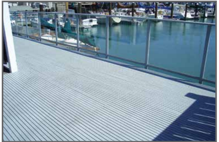
Corinthian Yacht Club Harbor in San Francisco, California.

Aqua Grate is available in a variety of lengths and widths, making it useful for a number of waterfront and recreational applications. The fine grit surface of Aqua Grate provides a high level of slip resistance, yet at the same time offers a comfortable barefoot walking surface. Protection against long-term UV exposure is provided by a synthetic surfacing veil and UV inhibitors in the resin formulation. Whether subjected to chlorinated water in public and private pools or salt water environments found in marine and waterfront applications, Aqua Grate will offer years of low cost, low maintenance service.