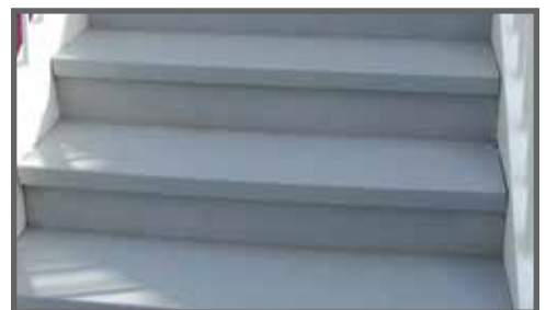
Covered stair treads, with hidden hold down clips, lead to a water slide at a municipal waterpark in Oklahoma.